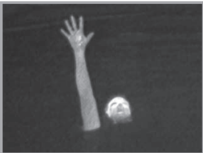
Security in Emergencies