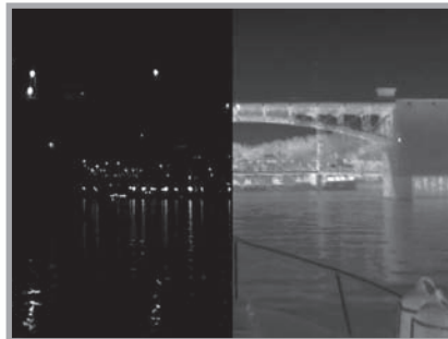
Your Vision vs. FLIR Vision